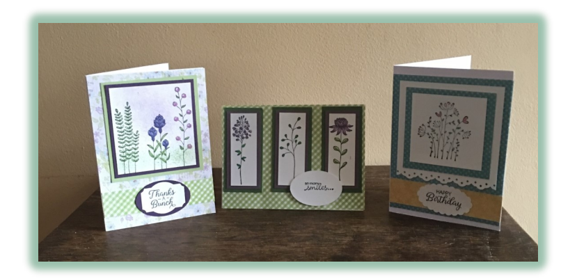
Project at meeting on April 8. Cost is $7. No supplies needed but if you wish to bring your own colored pencils or markers please feel free. Cards by Tina Kasten. These cards can be personalized with Happy Birthday, Get Well, Thank You, or Sympathy