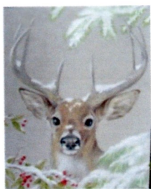
Winter Buck - 11"x14"