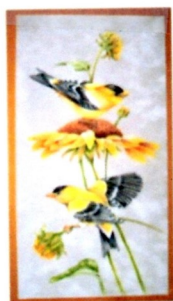
Gold Rush 7 1/2"x10 1/2"