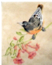
Baltimore Oriole 8"x10"