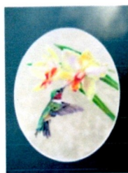
Natural Beauty - 11"x14" with mat