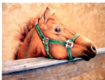
Young Hope - 11"x14"