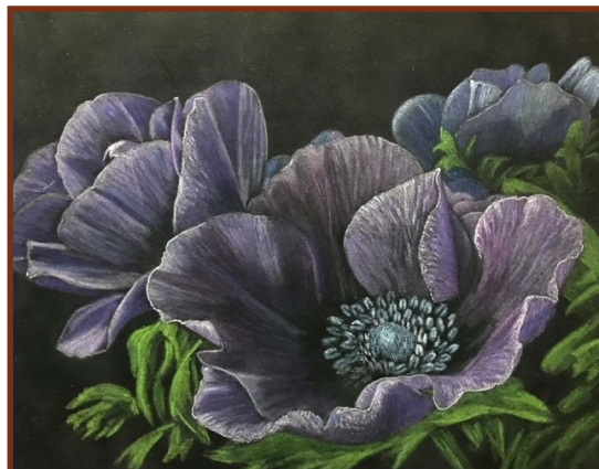
Suede Board 8x10 Colored Pencils