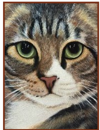
Masonite 4x6 Acrylics