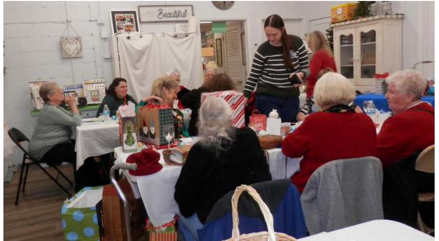
Party Attendees enjoying a good time visiting