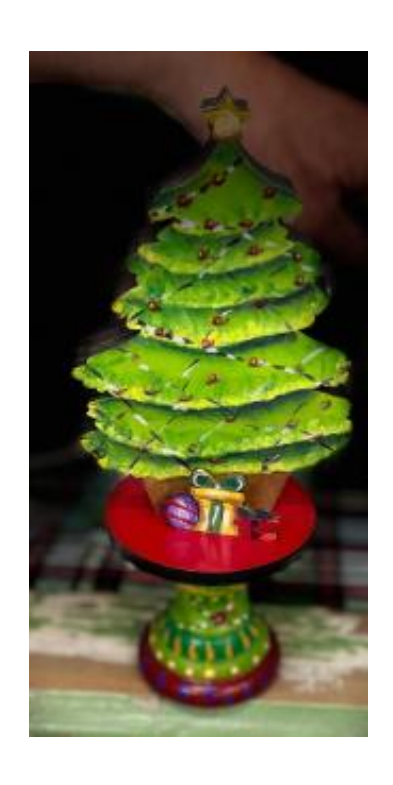
November 2024 https://gatewaydecorativeartists.com/newsletters/